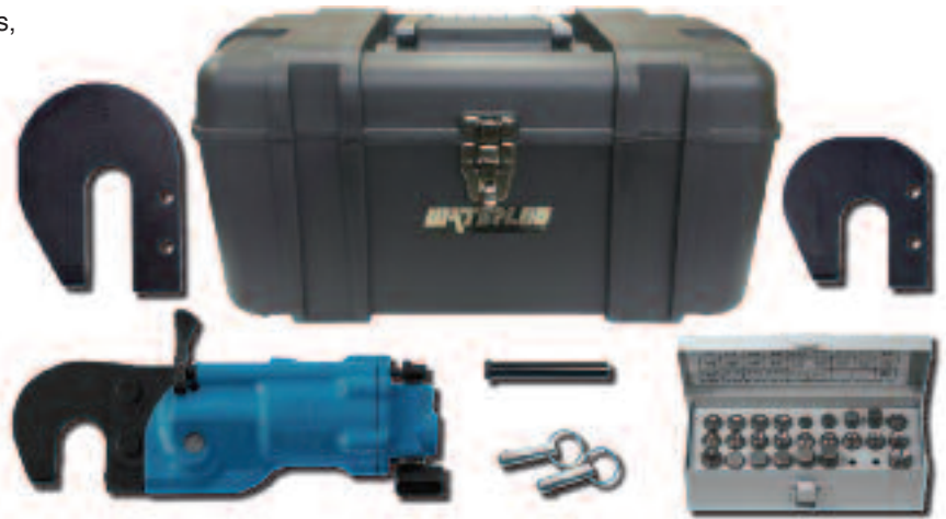
A Practical & Economical 38 Piece Kit